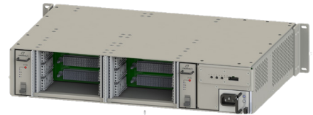
Figure 2: Rear View