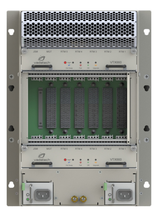
Figure 5: Chassis Layout - Rear