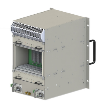
Figure 2: Rear View