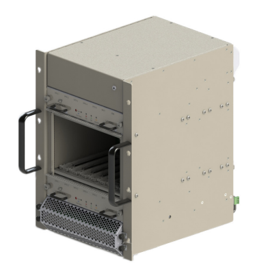
Figure 1: Front View

There is an optional JTAG Switch Module to provide JTAG access to the front.