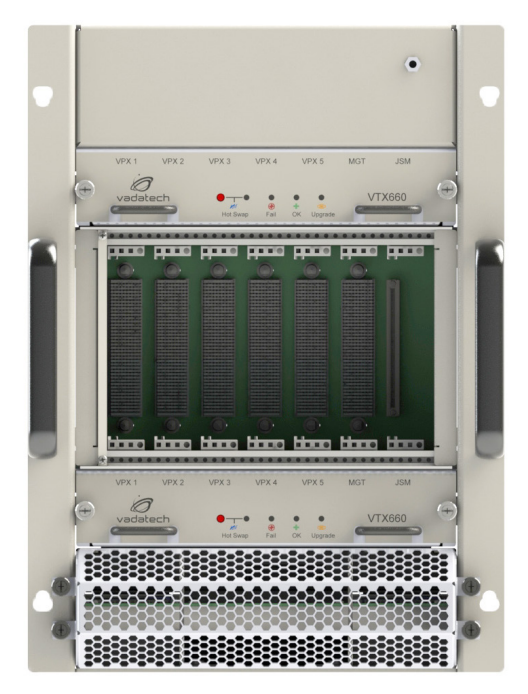
Figure 4: Chassis Layout - Front