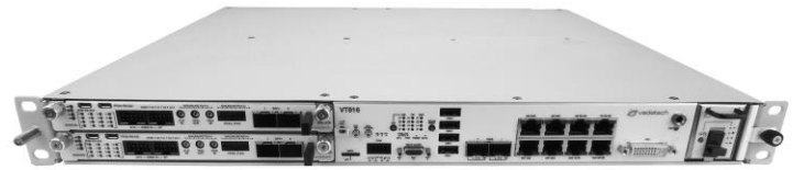
Figure 1: VT816 Front View

In some platform configurations the total cooling capacity of the chassis can be affected by airflow restriction caused by certain AMCs. This is especially so when using multiple high-power AMCs, which typically have larger heatsinks. Please consult VadaTech sales regarding AMC placement for optimal cooling.