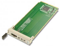
UTC008 μTCA JTAG Switch Module (JSM)