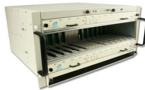
VT866 5U Chassis Platform