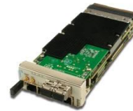
UTC004 MicroTCA Carrier Hub (MCH)