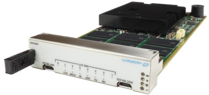
Figure 1: AMC645

The AMC645 is available in both air-cooled (MTCA.0 and MTCA.1) and rugged conduction-cooled versions (MTCA.2 or MTCA.3, contact sales for details).