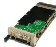
UTC004 MicroTCA Carrier Hub (MCH)